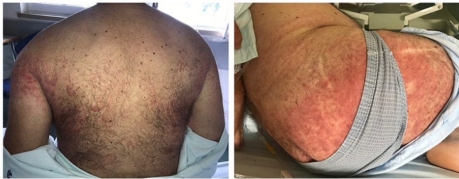
FIGURE 2: Staphylococcus aureus folliculitis

Multiple infected hair follicles with edematous papules and pustules, associated with erythema and warmth.