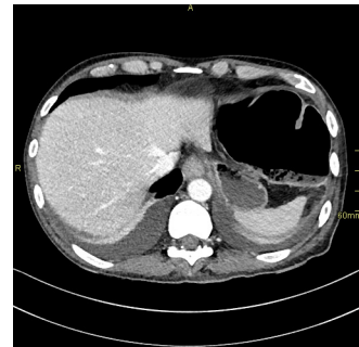
Figure 2 A CT image of the dilated transverse colon.

On day 23 of admission, the patient again spiked a fever (38.8°C) and became hypotensive (70/40 mm Hg). He was