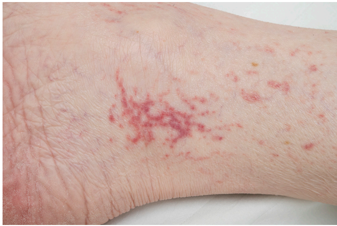
Figure 1 An erythematous, non-blanching patch on the right ankle.

infection. Given the high risk of perforation, a sigmoidoscopy was not attempted and hence IBD could not be fully excluded during the acute phase of the illness. The growth of Campylobacter on stool culture provided evidence for infective colitis and other common organisms were also excluded. Finally, the patient was not on medications that might have resulted in TM and potassium levels remained within normal range throughout admission.