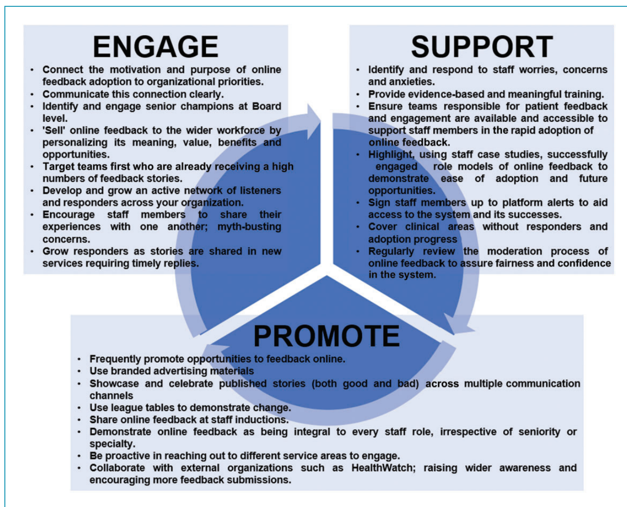
Figure 1. The Engage, Support and Promote Model for rapid adoption of online feedback platforms.

Factors found to facilitate implementation were often linked to engagement, support and promotion. Actions taken by the organisation to facilitate feedback implementation included moving its responsibility from