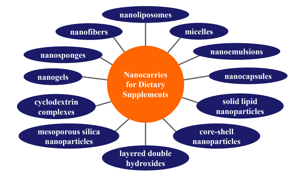
Figure 1. Most frequently used nanoformulation types of dietary supplements and foods for special medical purposes.

Gleeson et al. [52] looked into the potential of certain delivery strategies for the improvement of the oral bioavailability of different types of nutraceuticals, such as fatty acids, bioactive peptides, micronutrients, and phytochemicals, and emphasized that nutraceutical and pharmaceutical industries could leverage approaches to oral delivery formulations, which would result in synergies for nutraceutical and pharmaceutical molecules. For example, microfluidization could be considered as an efficient emulsification technique resulting in fish oil encapsulated powder producing emulsions at the nanoscale range ( d_{43} of 210–280 nm) with the lowest unencapsulated oil at the surface of