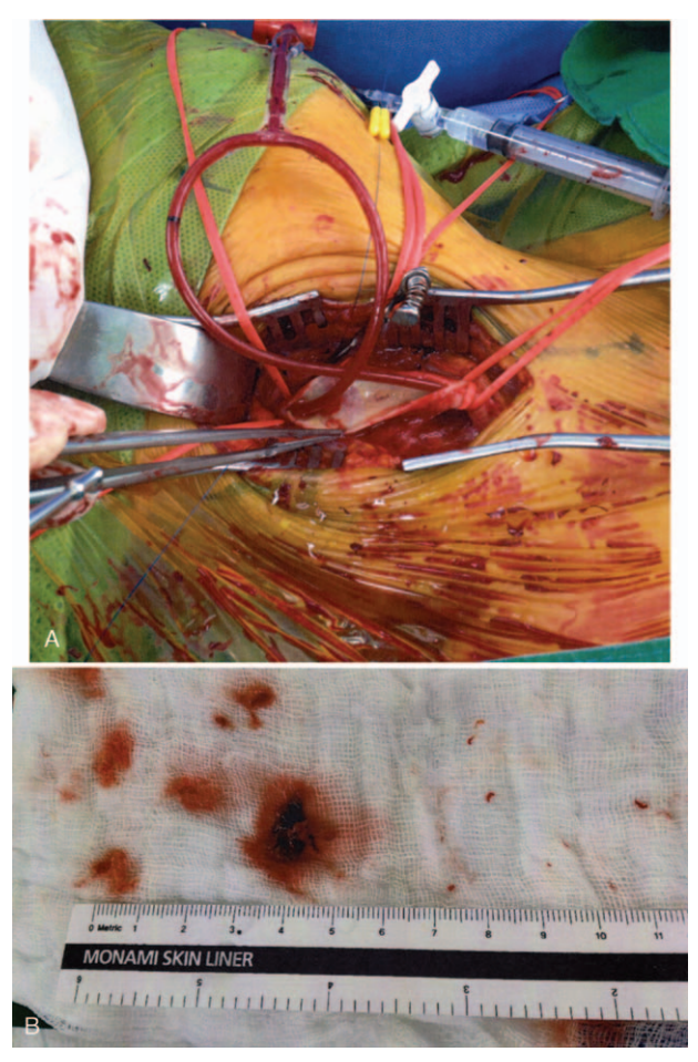
Figure 3. A. Internal carotid artery was exposed and opened longitudinally. Inahara shunt was inserted and thrombectomy was performed without event. B. Thrombi specimen was removed from internal carotid artery (1 \times 0.5 \text{ cm}) .