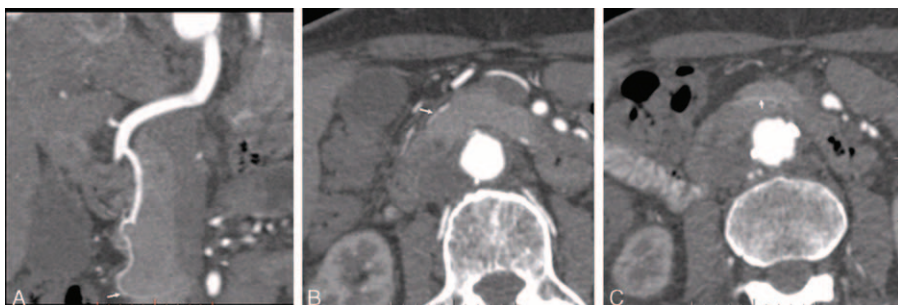
FIGURE 2. Visualization of the source of ASPDA with monochromatic images in a 76-year-old man. (A) CPR image showed the total source of ASPDA and the lower part of pancreatic head was noted (arrow). (B) The axial image showed that it run along the anterior and lateral surface of the pancreatic head (arrow). (C) The axial image showed that it went along the posterior surface of the uncinata process (arrow).

The display rate was significantly better in monochromatic images for the 2nd and 3rd segments of PSPDA, the total course of ASPDA and the artery of uncinata process ( P < 0.05) (Table 3). The kappa value of the independent ratings of assessment of the course of pancreatic arteries for the 2 independent radiologists were 0.89 for monochromatic images and