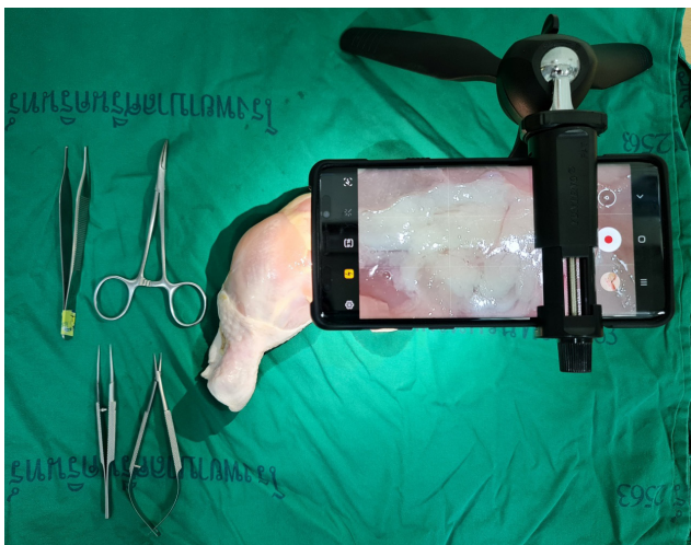
Fig. 2. Set-up of the operation under a smartphone.

For the experienced microsurgeon, the median operation time when using the smartphone was 32.5 minutes; this was significantly longer than the mean operation time of 20 minutes when using the microscope (Table 1). In subgroup analysis, the only significant difference in the mean operation time for the experienced microsurgeon was between using the smartphone and the microscope with 8-0 sutures ( P = 0.021 ). A subgroup analysis of the resident showed no significant difference in mean operation times between the smartphone and the microscope groups (Table 2). The operation time while using a smartphone by the resident was not significantly different when compared to the experienced microsurgeon ( P = 0.238 ). In contrast, the