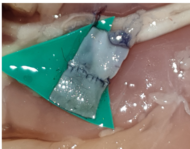
Fig. 3. The anastomosis of a vessel was evaluated using the anastomosis lapse index.