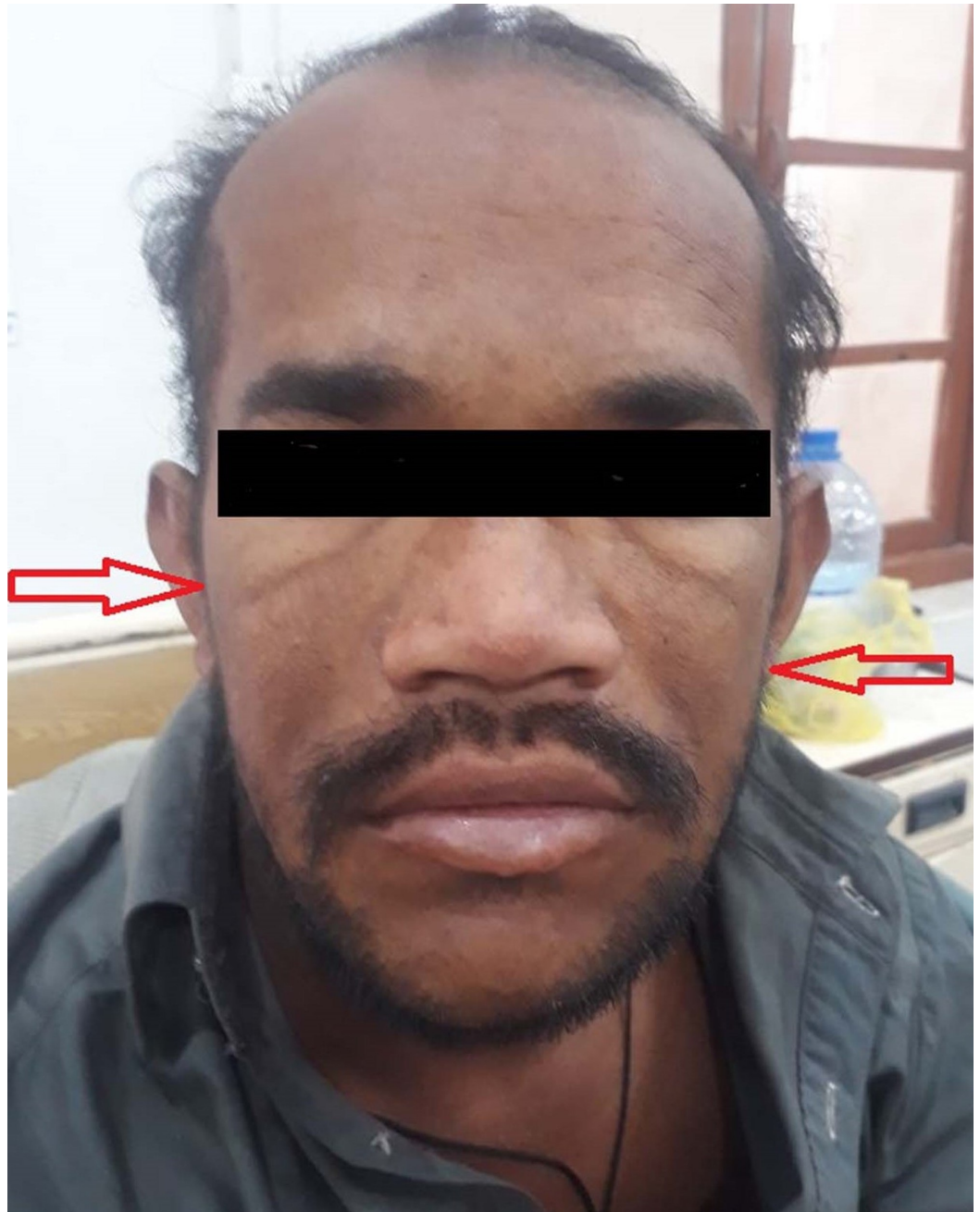
FIGURE 1: Facial puffiness of hypothyroid patient suffering from Hoffmann's syndrome.

A 28-year-old male, deaf and dumb since birth, presented to the medical department (MD) of Dr. Ruth KM Pfau, Civil Hospital Karachi (CHK) in November 2018 for the evaluation of generalized upper and lower limb weakness along with progressive facial puffiness (Figure 1) for the past nine years. There was also a history of lower limb swelling for the past seven years.