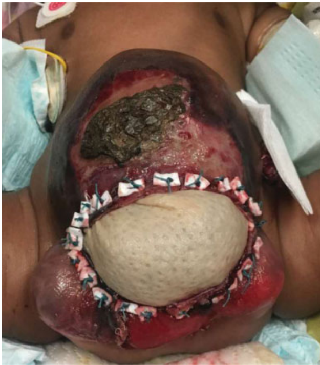
Fig. 3 Three months old: Postrepair with bowel patch between bladder plates and alloderm closure of omphalocele. Ostomy is in the left upper quadrant, under the gauze.

was followed to its junction with the cecal plate. The terminal ileum was divided from the cecal plate, leaving the cecal plate and some ileum attached between the bladder halves.