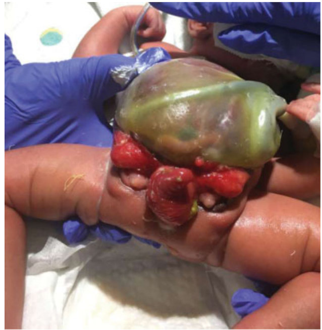
Fig. 1 Day of life 1: Inferior aspect with bladder plates and intussuscepted ileum at cecal plate and large omphalocele.

Due to the large nature of the omphalocele, abdominal closure at the time of the initial operation was not possible.