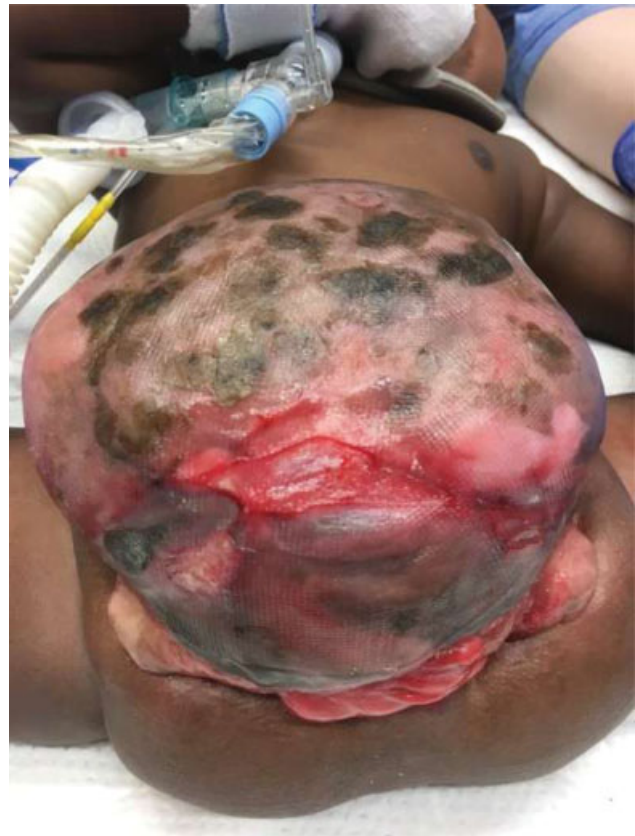
Fig. 4 Twelve months old: After alloderm patch has re-epithelialized. Bladder plates and bowel on inferior aspect of omphalocele.

Cloacal exstrophy represents a significant surgical challenge that requires a multidisciplinary surgical team approach and traditionally has several primary goals. First, to separate the cecum from the bladder plates, tubularize it, and mobilize the hindgut as an end stoma. This maintains bowel length and