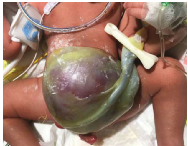
Fig. 2 Day of life 1: Large liver containing omphalocele.

The operation was initiated with a transverse laparotomy incision at the inferior edge of the epithelialized omphalocele sac. Once the intra-abdominal contents were reached, the cecal plate was examined. The very distal ileum was intussuscepted externally and was reduced. The terminal ileum was identified and eviscerated from the abdomen, and