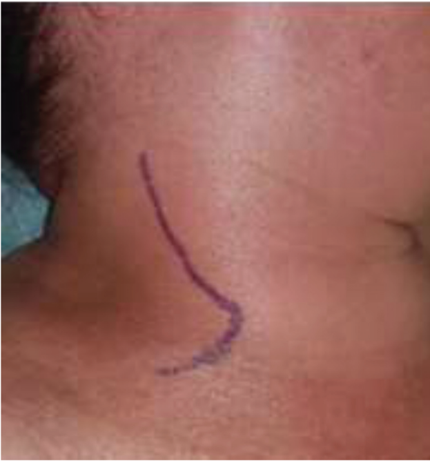
Fig. 1 Right lateral cervical region and schematic representation of the approach used in this study.