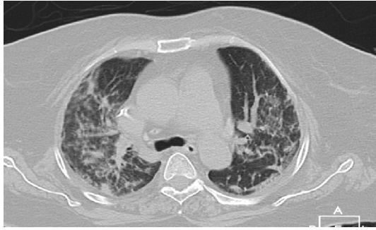
FIGURE 1: Chest computed tomography on admission showed multilobar ground-glass opacity with reticulation and consolidation in the center and periphery of both lungs.

also complained of cough, myalgia, and respiratory distress of three weeks' duration and reported dizziness and falling down 2 days before admission. She had no bladder symptoms of note.