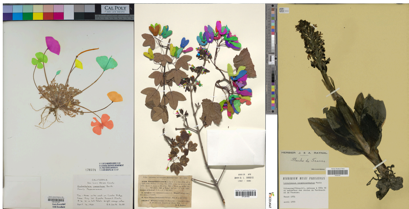
Figure 2. Examples of herbarium specimens displaying visual heterogeneity (e.g., in morphology, labels, and color standards) and challenges related to the morphology and position of reproductive structures. The specimen on the left shows large, isolated reproductive structures that would likely be annotated successfully by ML algorithms. The specimen in the center with small flowers and numerous overlapping fruits would be much more difficult for ML algorithms to parse. The specimen on the right would be very difficult for ML algorithms to delineate or count because of the unclear distinction between flowers and buds. Examples of segmentation masks (see the glossary in box 1) created to delineate reproductive structures are shown by the brightly colored areas in the left and center specimen images.

worldwide are not digitized. Continued digitization of herbarium specimens is needed, particularly of phylogenetically and morphologically diverse collections that can reflect visual variation among specimens and therefore enable the creation of more versatile training data sets.