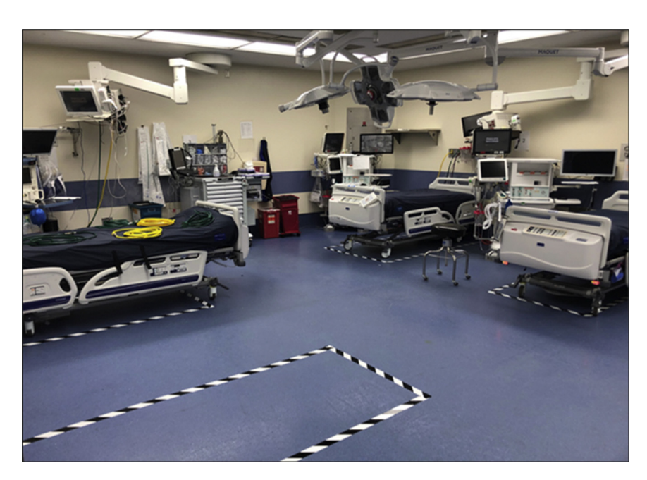
Figure 1. Representative photograph of an ORICU: This is an operating room that has been modified to accommodate up to 4 ventilated patients with COVID-19, each with a separate ventilator, gas lines, and other equipment.

Despite the elimination of elective surgery, we retained a core of our usual staff to cover continued practice activity. Most of our non-redeployed staff worked from home, although a rotation was established in which one office worker and one clinical extender were physically present in our office each day, to check mail, receive outside medical records and films, and conduct in-person patient visits. Similarly, although many of our residents and some faculty were redeployed, a core number of each were maintained to cover our clinical services, respond to emergencies, and perform urgent and emergent surgery. Specifically, we kept at least 1 surgeon available at all times who was capable of general cardiac surgery procedures, as well as more specialized areas such as aortic surgery and mechanical cardiac assistance/transplant. A