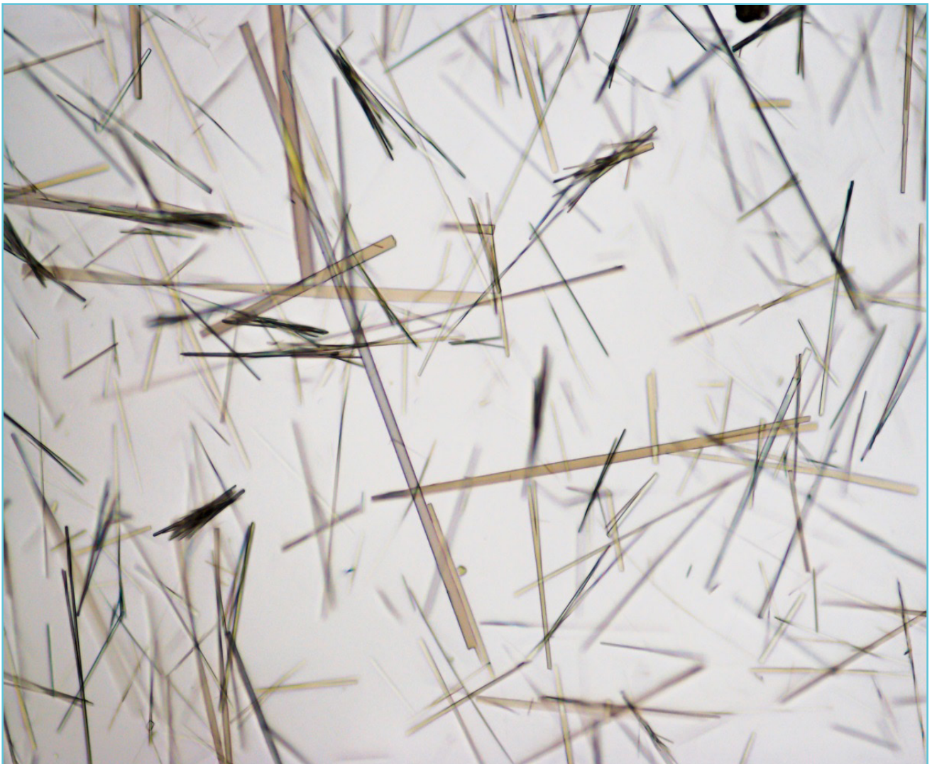
Figure 1 Acyclovir crystalluria: Light microscopy of a wet mount of urine sediment showed abundant sharp needle-shaped transparent crystals (400 × magnification)

Automated urinalysis (Roche Diagnostics Canada, Laval, Quebec, Canada; u6500 analyzer) showed presence of leukocyte esterase, protein and blood. The specimen was too turbid for determination of specific gravity. The specimen was flagged for manual microscopy, which showed very abundant needle-shaped crystals. These were initially reported as "needle-like crystals,