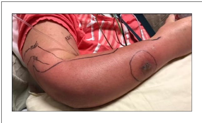
Figure 2. Appearance of patient's arm on day 7 of hospitalization. Borders of erythema became less poorly demarcated and spread into the arm and medial forearm. The edema had extended into the hand and digits.

on flexion of the right wrist and digits. Ultrasound of the right arm showed soft tissue edema. Subsequent magnetic resonance imaging showed an elbow joint effusion and myositis without pyomyositis or abscess (Figure 3). Voriconazole IV was added on day 7 for empiric antifungal coverage. The patient's chest port was removed on day 8 of hospitalization and was culture-negative.