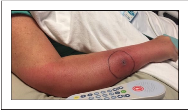
Figure 1. Appearance of patient's arm on day 5 of hospitalization. The ulcerated region was the location of the dog scratch, and the drawn circle denoted the borders of erythema marked 3 days following the incident and 1 day prior to hospitalization. Borders of erythema were sharply demarcated, and edema was mild.

Amoxicillin/clavulanate was discontinued, and vancomycin intravenous (IV) and piperacillin/tazobactam IV were begun at admission. Cultures of blood from her chest port and urine were found to grow Pseudomonas aeruginosa with identical susceptibilities, including to piperacillin/tazobactam and cefepime. Culture of blood taken at the same time from a peripheral site was negative, and all subsequent blood cultures during hospitalization were negative. Despite the empiric broad-spectrum antibiotic therapy, the cellulitis worsened. The borders of erythema became more sharply demarcated by hospital day 5 (Figure 1), and the patient experienced daily fevers with maximum temperature of 39.2°C. Clindamycin IV was added for its antitoxin effect on day 5. By hospital day 7, the erythematous patch became less well-circumscribed (Figure 2), and she developed increased pain and decreased strength (4/5)