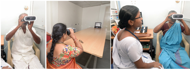
Figure 1 Testing procedure for the wavefront autorefractor. Participants looked through the open-view wavefront autorefractor at a distant back-lit visual acuity chart, while three 10 s videos of wavefront images were recorded by the device. The autorefractor was flipped over to measure the opposite eye. After repeating three times, the system displayed the autorefractor eyeglass prescription.

video was acquired, the device was flipped upside down to measure the opposite eye and the procedure was repeated. The participant was then measured two additional times for a total of three measurements of each eye. After the first interpupillary distance adjustment was made, typically no further adjustments were necessary. The device computed the median of the three measurements and displayed this prescription in the same format as subjective refraction on a companion laptop.