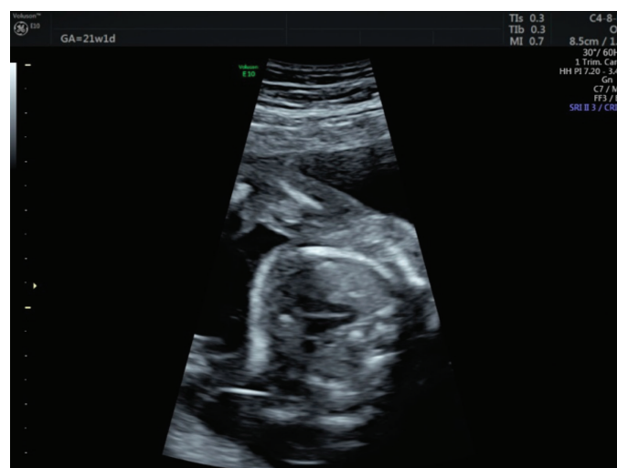
Figure 5. Transverse diameter of the ductus arteriosus after resolution of the constriction (Case 2)