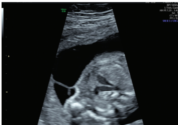
Figure 3. Narrowing in the ductus arteriosus (Case 2)