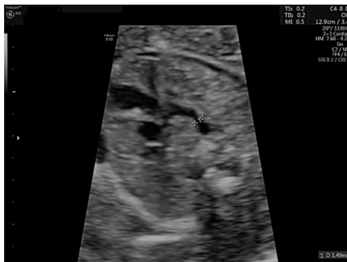
Figure 1. Narrowing in the ductus arteriosus (Case 1)