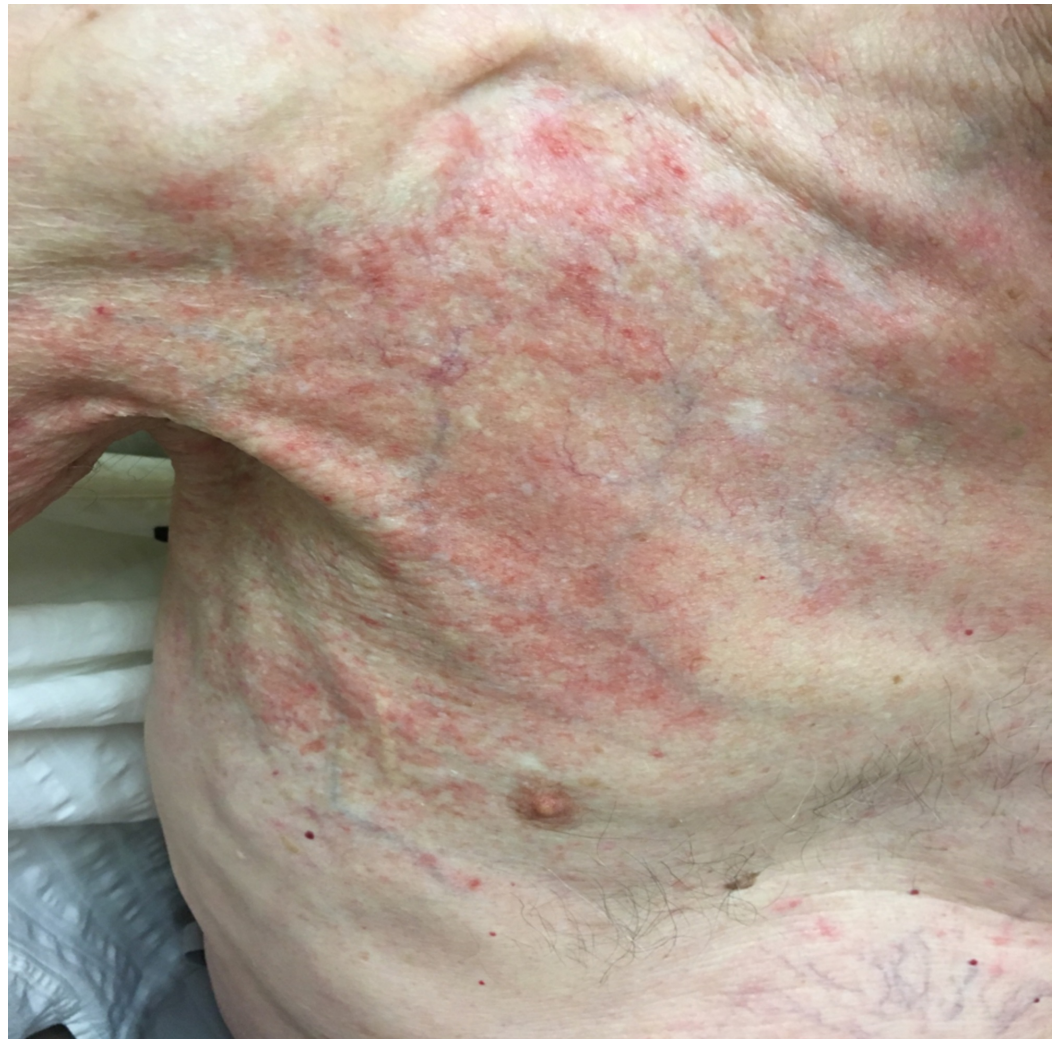
FIGURE 2: Radiation recall dermatitis in the patient's right arm and shoulder, extending to the anterior chest wall.

The diagnosis was consistent with RRD manifesting 66 years of radiation treatment. He was managed symptomatically with topical triamcinolone and oral antihistamines. The rash improved and completely resolved within three weeks. Upon resolution of dermatitis, the patient was rechallenged with the same dose of gemcitabine/cisplatin, and on this occasion, he tolerated it well.