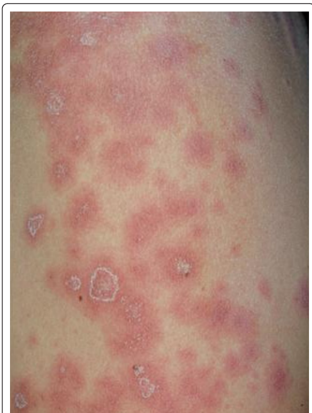
Figure 1 Papulosquamous lesions on the arm of a patient typical of subacute cutaneous lupus.

The presence of LLS secondary to anti-TNF \alpha therapy in patients with SpA appears to be less frequently observed compared with patients with RA, probably because in