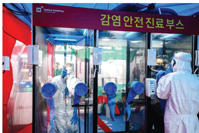
Image 3: A COVID-19 sample collection mobile booth in South Korea. [39]

This mobile booth for COVID-19 sample collection, which was first innovated in South Korean, is now being rapidly introduced in Indian scenarios also. This Phone style mobile booth helps the doctors in the collection of samples safely and efficiently and reduces the requirement of personal protective equipment (PPE) kits. [38]