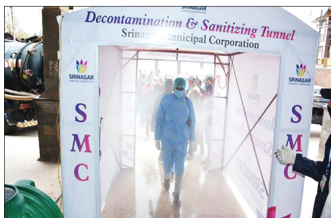
Image 4: A prototype of decontamination and sanitizing tunnel for fighting against COVID-19 in Srinagar, India. [40]

In the battle against COVID-19, the engineers and technical personnel of different countries are not behind scientists. A recent breakthrough in equipping hospitals and health workers with coronavirus-fighting devices in India known as the "Decontamination and Sanitizing Tunnel" has demonstrated its efficacy in decontaminating and sanitizing the public and doctors from the COVID-19 virus. [40]