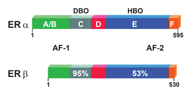
Figure 4 The domain structure of the oestrogen receptors. The N-terminal domain with its ligand-independent activation function-1 (AF-1). The C (DNA-binding) domain mediates sequence-specific DNA binding. The D- or hinge-domain contains nuclear translocation signal and the multifunctional E/F domain, responsible for ligand binding, homo- and heterodimerization, and ligand-dependent co-factor interaction (AF-2).

a pattern that partially coincided with that of 17\beta -estradiol (Taranta et al 2002), strongly suggesting that this molecule could partially act on bone metabolism not fully blocking bone remodeling, but instead modulating it as estrogens do before menopause. More interestingly, our recent studies have demonstrated that RAL treatment is able to decrease circulating cytokines levels in postmenopausal osteoporotic women (Gianni et al 2004), strongly suggesting that this molecule could modulate bone turnover by controlling cytokines levels after menopause.