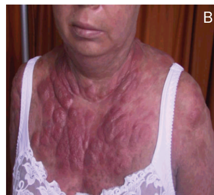
Figure 1. (A and B) Before 2CdA treatment: patient died of S. aureus sepsis after the second pulse.