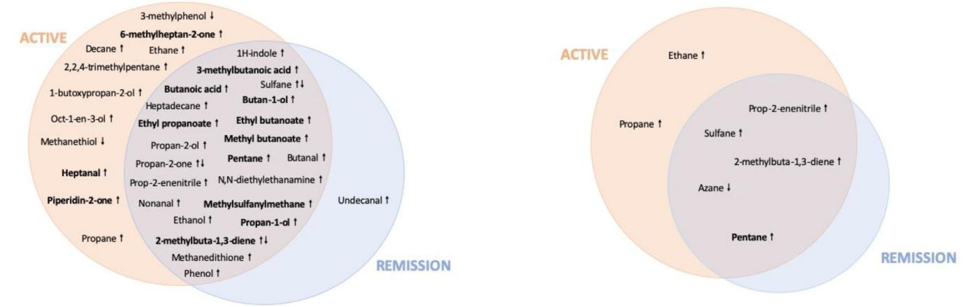
Fig. 1. Individual VOCs in IBD and IBS. Compounds described in more than one study are in bold. ↑: upregulated. ↓: downregulated.