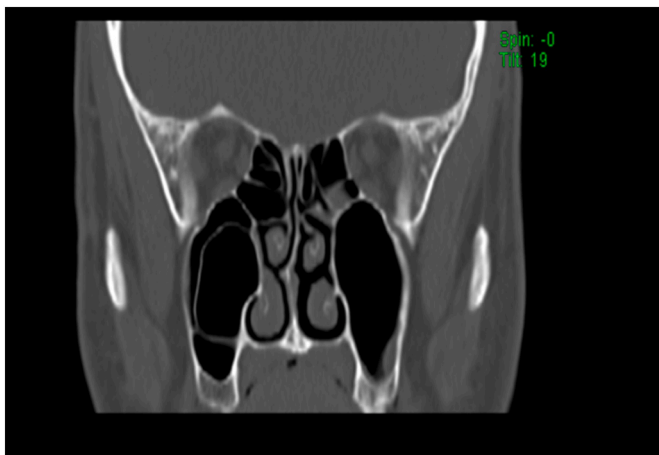
Fig. 1. Coronal section of CT air cell in the right maxillary sinus with evidence of hypertrophied inferior turbinate.

Asymptomatic maxillary air cysts should be left untreated. However,