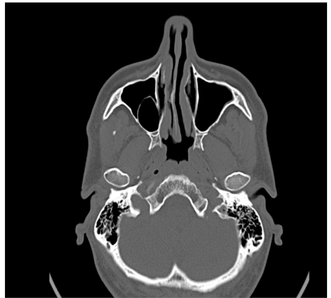
Fig. 2. Axial section of CT air cell in the right maxillary sinus with a deviated nasal septum mainly on the right side.