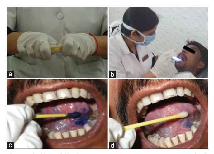
Figure 1: Use of Vizilite as an oral cancer screening method. (a) Activating Vizilite capsule by flexing it, (b) examination of the patient's oral cavity with Vizilite, (c) application of toluidine blue stain with cotton bud, (d) removal of mechanical retention of dye with 1% acetic acid

Literature indicates the poor prognosis of patients with oral SCC, despite advances in management strategies with