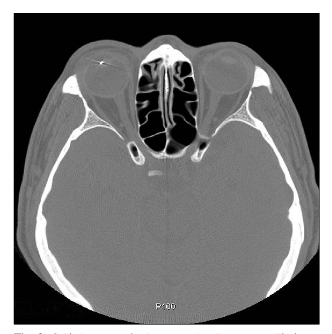
Fig. 2. Orbital computerized tomography shows a metallic intraocular foreign body in the lens.

jections of vancomycin (1 mg in 0.1 mL for Gram-positive coverage) and ceftazidime (2.25 mg in 0.1 mL for Gramnegative coverage). The foreign body in the lens was a piece of metal. During the operation, we aspirated some humor in the anterior chamber for identifying the causative bacterium and tests of antibiotic sensitivity.