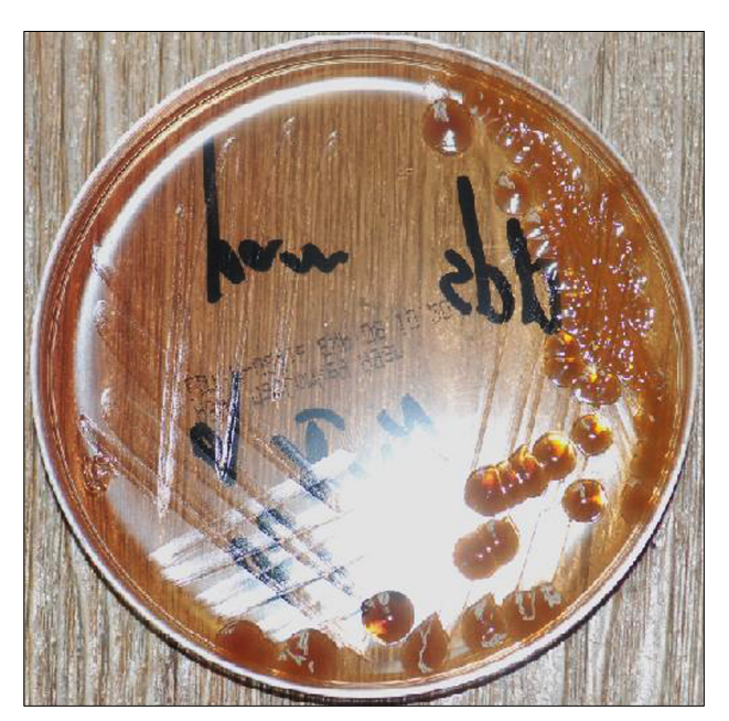
Fig. 3. A culture of aspirated aqueous humor from the anterior chamber shows growth of Pantoea species (culture media: McConkey agar).

The day after operation, there were severe stromal edema and Descemet's membrand folds in the cornea and +3 to +4 cells, no hypopyon in the anterior chamber, and grade 3 vitreous opacity. The patient was treated with ciprofloxacin