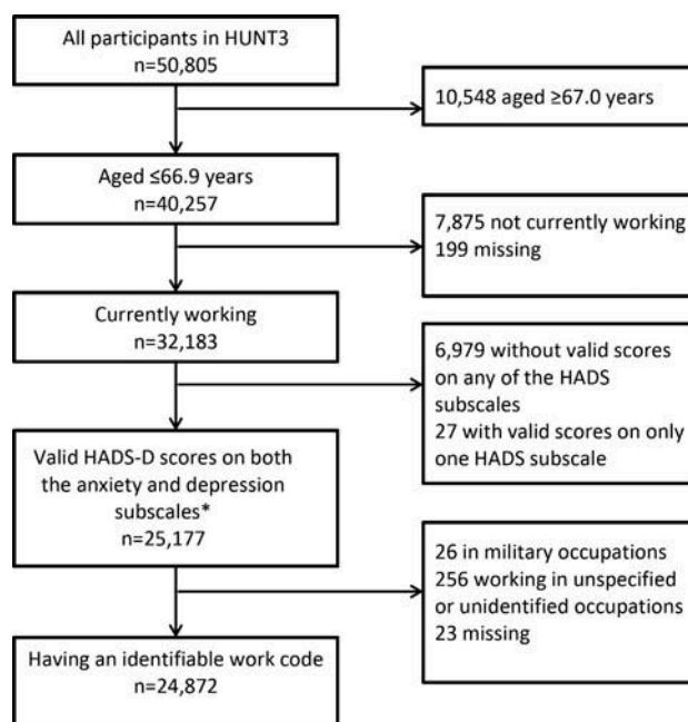
Figure 1. Flowchart showing the selection of study participants. HUNT3 (2006–2008). *Valid scores defined as having answered at least 5 out of 7 questions on both HADS subscales.

In the interview, participants aged 70 or younger were asked the question: “Are you currently working, a student or working at home?” Each of the three had the response alternatives “yes” and “no.” According to the questionnaire guidelines, “working” included everyone who earned an income. “Working at home” included people who cared for children or others in their home, without earning an income. We defined everyone who answered “yes” to “working” ( n = 32,183 ) as being occupationally active, regardless of whether they worked full-time or part-time. We