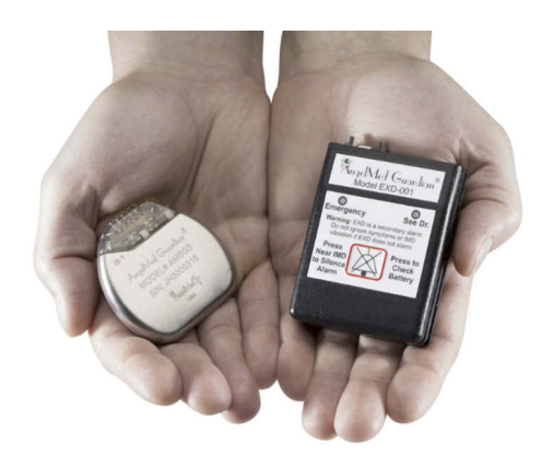
Figure 2 Implantable medical device (IMD) and external medical device (EXD).