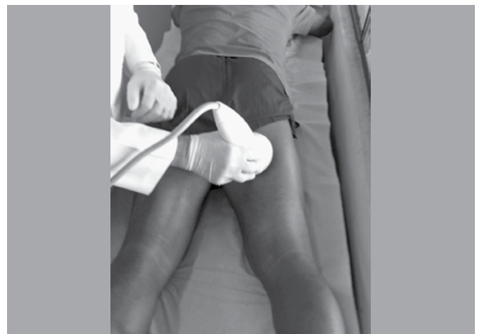
Figure 3. Twenty-six year old patient during the first ESWT session at posterior thigh muscle injury. The transducer is positioned directly over the injury site.