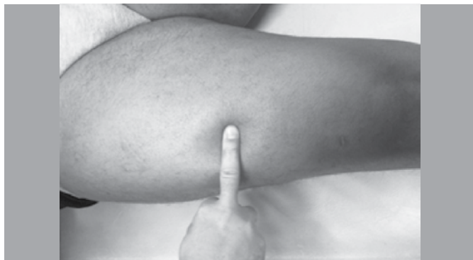
Figure 1. Presence of a gap detected at physical examination in the place where the patient reports pain, featuring a more severe quadriceps muscle injury.

Extracorporeal Shock Wave Therapy (ESWT) was applied the day after the initial evaluation. ESWT was performed through an Evotron-Switch device with energy flux density of 0.03-0.06 mJ/mm 2 . Overall, 900 pulses are applied per injury at 240 pulses/min frequency. There was no need of anesthetic procedure for conducting the treatment. A second ESWT session was held after 3 weeks, if necessary (persistent functional disability). (Figure 3)