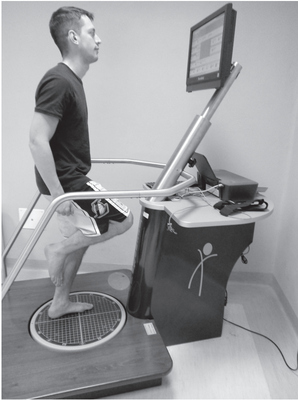
Figure 3. Balance test