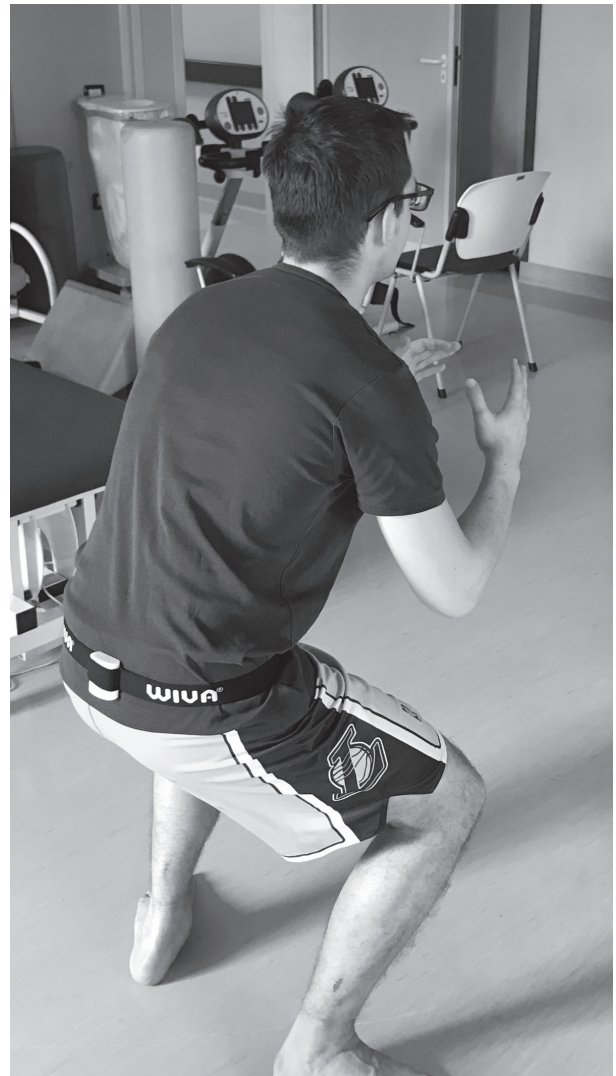
Figure 2. Accelerometer test

Stiffness test (ST) was executed with counter-movement jump followed by seven jumps at extended knee and landing after the seventh jump controlling the vertical position without doing further hops. The parameters tested with ST were: maximum height, average height, average time of flight, power of the best jump, average power and average stiffness. Moreover patients were tested with a balance test on stabilometric platform (Tecnobody Prokin, Dalmine (BG) Italy).