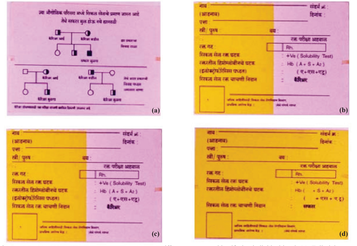
Fig. 2. Colour coded genetic cards showing different shades for different genotypes identified at individual level. (a): Full pink report card for HbAA (Normal) with sketch representation of pattern of inheritance of HbS gene on the back side. (b) & (c): Half-pink-half-yellow report cards for HbAS (heterozygote). (d): Full yellow report card for HbSS (SCD) patient.

While elaborating the results to the parents of the baby tested, simple words were used to convey the 'risk/