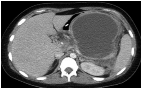
Fig. 1 Axial cut of computed tomographic scan demonstrating pseudocyst posterolateral to stomach.

Oregon, Ohio, United States) (→Fig. 2A). A 12-mm port was then directly introduced into the stomach under vision of the gastroscopist as well as the laparoscope (→Fig. 2B). It is very important to have the visualization through the gastroscopist while placing the initial transgastric port as the cyst protruding from the posterior gastric wall compromises the gastric lumen severely. If performed without the visualization of the gastroscopist there is a risk injury to the posterior gastric wall during the transgastric port placement. One of the other ports used for gallbladder removal was then also introduced into the stomach under vision. The 5-mm 30-degree telescope was then introduced into the stomach and the stomach was continuously insufflated with low flow. The pseudocyst was easily identified on the posterior wall of the stomach. A laparoscopic needle was introduced through the laparoscopy port into the cyst to confirm the position of the cyst (→Fig. 3A). A harmonic scalpel was then introduced into the stomach through the same port and an opening was made into the posterior wall of the stomach into the cyst (→Fig. 3B). Once this was achieved a 30-mm Endo GIA (Covidien, Mansfield, Massachusetts, United States) stapler was introduced through the 12-mm umbilical port and a stapled cystogastrostomy was achieved (→Fig. 3C, D). The cyst contents were suctioned and the cyst was irrigated with saline. Gastric port sites were closed with 3-0 vicryl interrupted sutures.