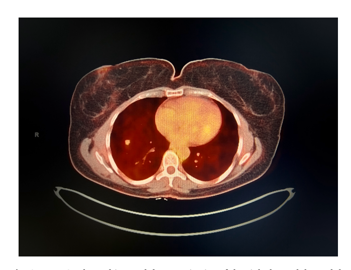
Fig. 2. PET/CT showed interval decrease in size of the right lower lobe nodule now measuring 1.6 cm with SUV max 2.3.

There are no randomized phase III trials that reveal any impact of adjuvant radiation therapy on progression free or overall survival in patients with uterine sarcomas. Reed et al., examined the role of