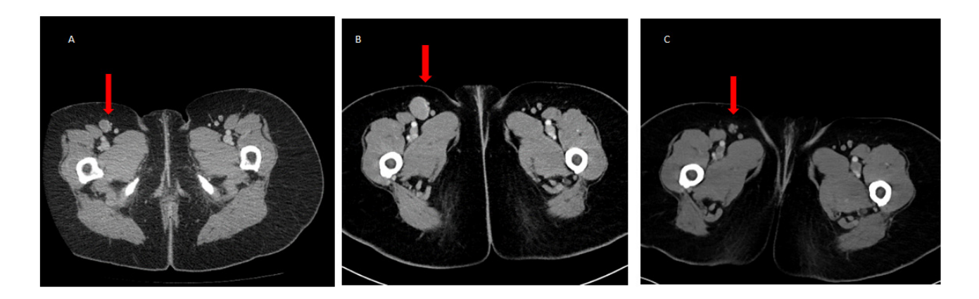
Figure 1: CT scan of abdomen and pelvis of non-injected lesion for patient 11. (shown by the arrow) at A. screening B. 1 months post last injection and C. 4 months post last injection. Initial progression followed by regression was observed in (B) and (C), respectively. This figure reflects both pseudo-progression and abscopal response.