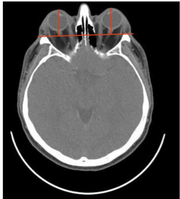
Figure 4. CT scan demonstrating that the distance from the anterior margin of the globe to the interzygomatic line exceeds 21 mm, indicating significant bilateral proptosis.

Graves' disease can be managed with three different treatment modalities: antithyroid medications, radioactive iodine, or surgical removal of the thyroid gland [4]. The success rate