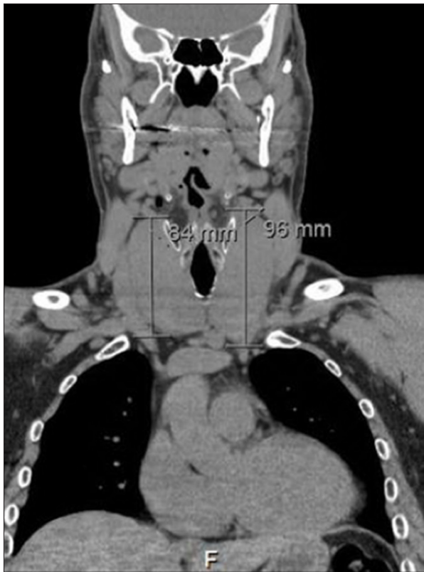
Figure 3. CT scan showing diffuse enlargement of the thyroid with no retrosternal extension or invasion of surrounding structures.

pathology report showed diffuse hyperplasia consistent with Graves' disease with no evidence of malignancy. After the surgery, the patient was moved to the Intensive Care Unit (ICU), where he was assessed and found to be stable with no signs and symptoms of thyrotoxicosis or hypocalcemia. Three days later, the patient was discharged with orders to take calcium carbonate (600 mg orally, three times daily) for 30 days, acetaminophen (650 mg orally, as needed) for 10 days, levothyroxine (125 mcg orally, daily) for 120 days, and calcitriol (0.5 mcg orally, daily) for 30 days.