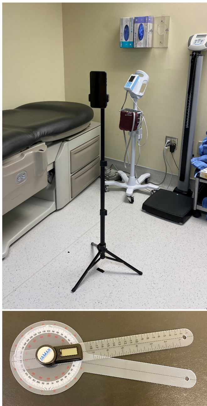
Figure 1 A mobile phone camera mounted on a TRIPOD (top) will be used to record videos of the joint hypermobility assessments. A 12.5" JAMAR Plus+clinical-grade digital goniometer (bottom) will be used to measure the range of motion at each joint. TRIPOD, Transparent Reporting of a multivariable prediction model for Individual Prognosis or Diagnosis.