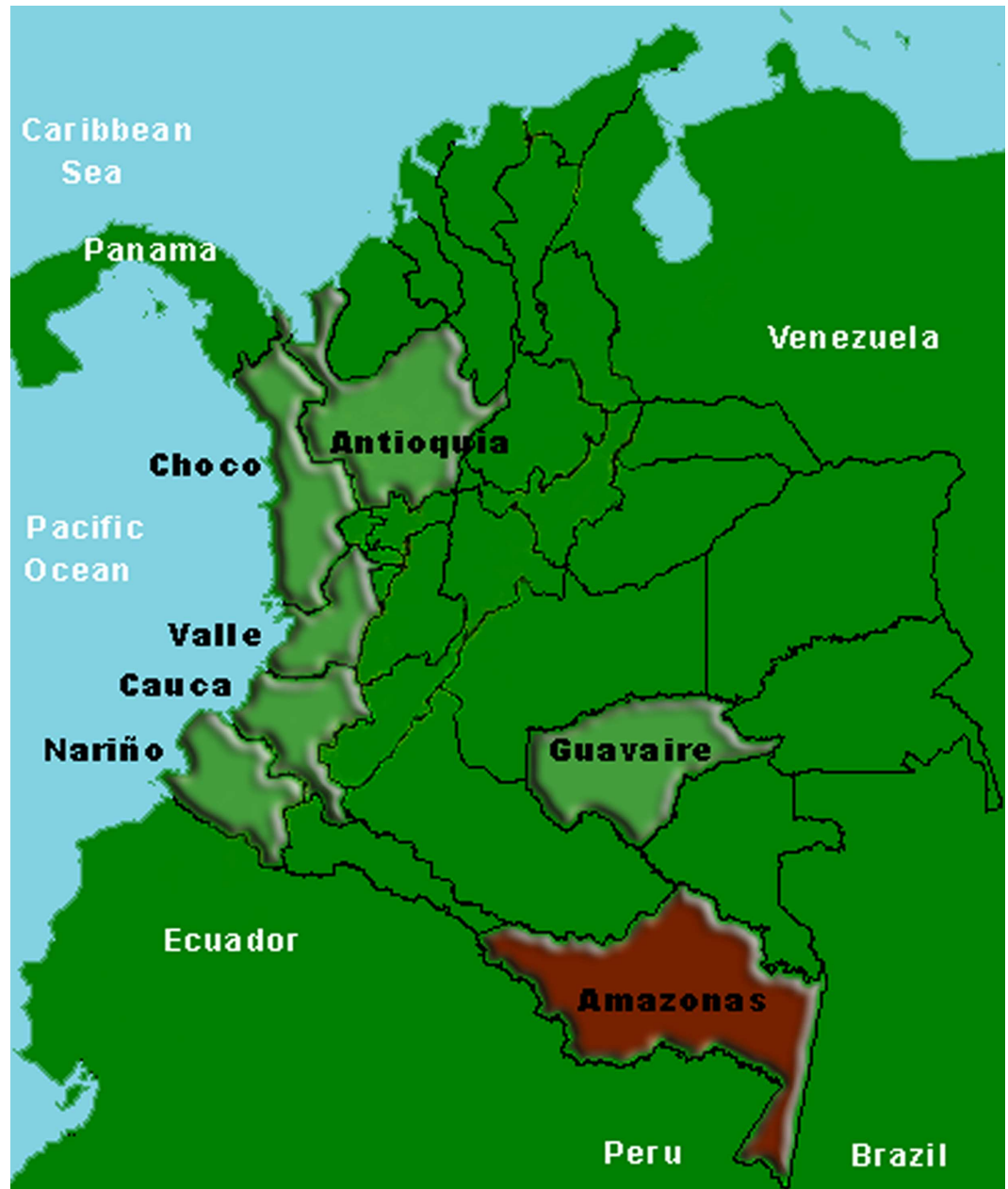
Fig 1. Sample collection sites in Colombia. On the map the sample collection sites are highlighted. The names in black indicate the seven Colombian Departments from which the isolates studied were collected: Antioquia (N = 42), Choco (N = 74), Valle (N = 27), Cauca (N = 44), Nariño (N = 122), Guaviare (N = 26) and Amazonas (N = 39). The study site highlighted in red, Amazonas, indicates the Department where pfhrp2/pfhrp3 double negative isolates were found.