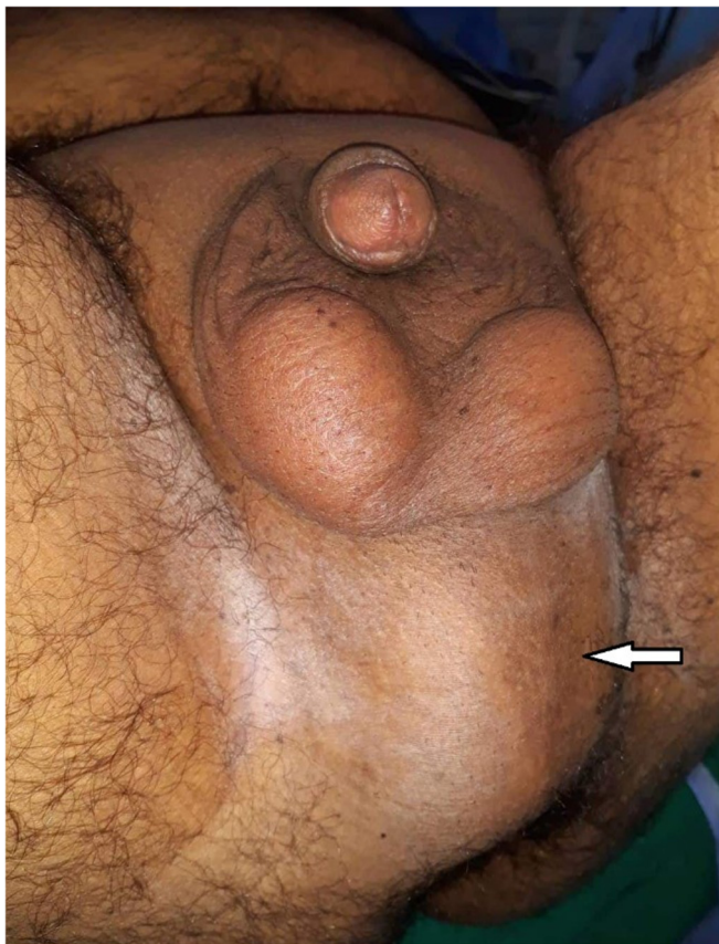
Fig. 1. The large swelling extending from the gluteal region to the base of the penis.