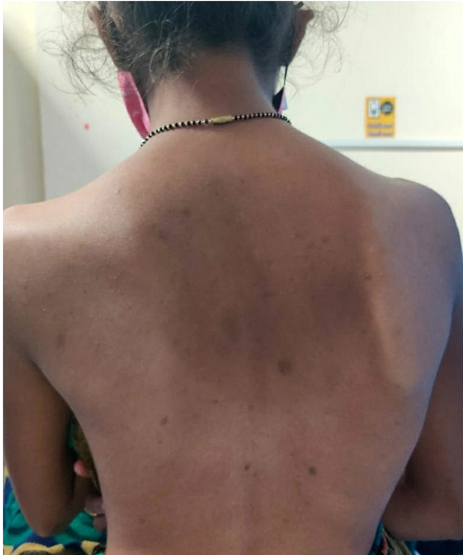
FIGURE 1: Posterior postural evaluation

examination, chest expansion was mildly decreased posteriorly. Tenderness was present over the right posterior shoulder. Range-of-motion assessment was done by a goniometer (Tables 1, 2). Manual muscle tests were done with lumbar flexors-extensors, core abdominals, shoulder flexors, extensors grade 4+, abductors adductors grade 3+, internal-external rotators grade 4+, elbow flexors- extensors grade 4+, and wrist flexors-extensors grade 4+.