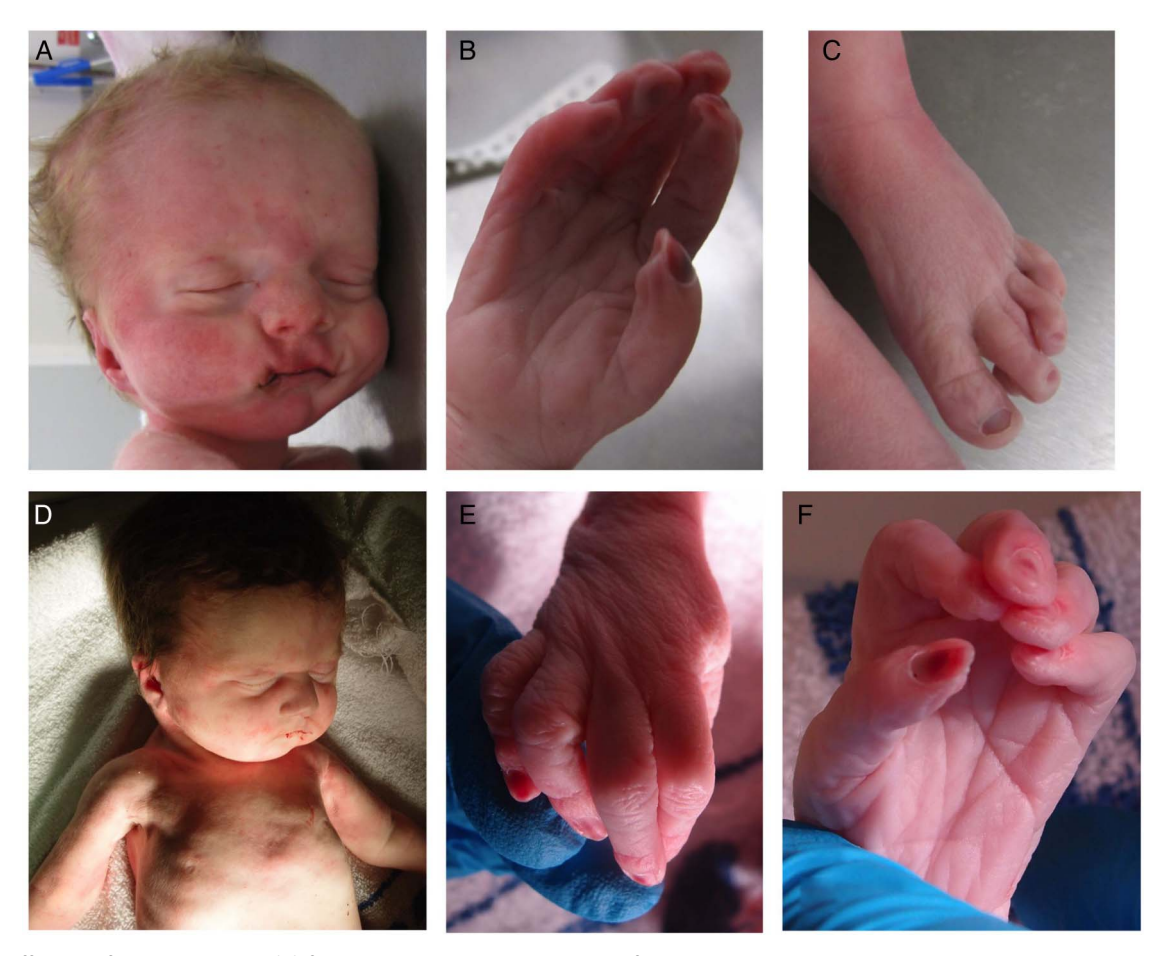
Figure 2 Affected infant III:2 showing (A) facial dysmorphism including a tall forehead with bitemporal narrowing, a long philtrum and a small chin; (B) the right hand showing long tapered fingers with contractures and (C) the left foot with overlapping toes. Affected infant III:4 showing (D) facial dysmorphism including a square forehead and small chin; apparent deficiency of pectoralis and proximal limb musculature (E and F) contractures of the proximal interphalangeal joints in the right and left hand, respectively.

The second child (III:2) was born at 35<sup>+1</sup> weeks following spontaneous labour. During the pregnancy, serial growth scans had detected a right duplex kidney and increased liquor at 28 weeks. A scan at 34<sup>+2</sup> weeks revealed polyhydramnios and gross right-sided hydronephrosis. The baby's birth weight was 1.80 kg (2nd centile) and his OFC was 33.5 cm (75th centile). Apgar scores were 1 at 1 min and 1 at 5 min. The baby died shortly thereafter, following unsuccessful resuscitation attempts. A postmortem examination noted dysmorphic features that included a tall forehead with bitemporal narrowing, a long philtrum and a small chin (figure 2A). He had long tapered fingers with contractures and overlapping toes (figure 2B, C). A single testis was palpable. There was a midline posterior cleft palate, and the right and left lungs were both extremely small (7 and 5.75 g). There was no obvious diaphragmatic hernia, but the domes were very high with extremely small pleural cavities. The right renal pelvis was extremely dilated with an obvious pelviureteric junction obstruction; the left kidney was normal.