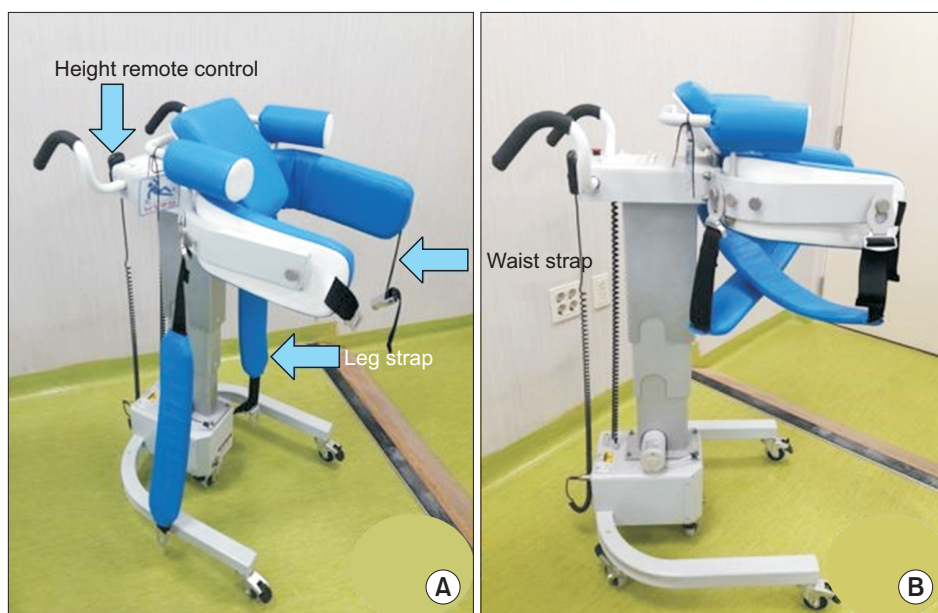
Fig. 1. Transfer assistance robot, an inward gait training device, consisted of waist and leg straps, height remote control, and handle. (A) All straps are unfastened. (B) All straps are fastened.

Four Robin-T (TES Co., Osan, Korea) units were used at Dong-A University Hospital, in Busan, Korea since February 2014. Originally, the robot was developed for transferring patients who had difficulty to move so that their activities of daily living (ADL) could be improved. However, it could not be used because of a long preparation time to put on safety equipment and its slow speed of moving. However, the safety equipment for preventing falls provided good stability. This feature could allow the robot to be used as a sitting device, a standing frame, or