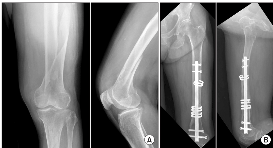
Fig. 1. (A) Preoperative radiographs of the left knee in an 81-year-old woman. (B) Radiographs taken 1 year after surgery. We performed retrograde intramedullary nailing and used shape memory alloy to reinforce mechanical stability. Bony union was achieved without complication.