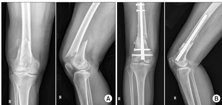
Fig. 2. (A) Preoperative radiographs of the right knee in a 71-year-old woman. (B) Radiographs taken 1 year after surgery. We performed retrograde intramedullary nailing with cement augmentation. We achieved good mechanical stability of the bone implant construct and recommended early rehabilitation.

fracture line was located above the flare of the femoral condyle and the configuration of the fracture was spiral or long oblique, we used shape memory alloy (Fig. 1, Table 1). Even in the A3 type fracture, if the configuration of major fragments was spiral or long oblique, we applied shape memory alloy. When we applied shape memory alloy, we paid close attention to preserve periosteum and applied shape memory alloy outside of the periosteum. To improve mechanical stability of the bone implant construct and to prevent pulling out of the interlocking screw, we used cement augmentation (Figs. 2 and 3, Table 1). In the A3 type fracture with anterior cortical comminution, we also used cement augmentation (Fig. 3). From the 1st postoperative day, joint exercise using a continuous passive motion machine was started and weight bearing was allowed at the 6th postoperative week.