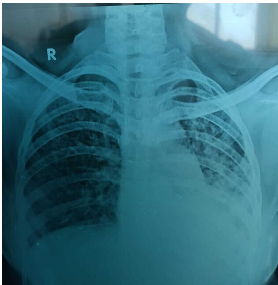
FIGURE 1: Chest radiograph on day one of admission

Chest radiograph shows left lower lobe haziness, enhanced bronchovascular markings, and multiple patchy consolidations.