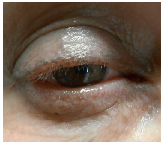
Figure 1: Eyelashes regrowth, right eye

eyelashes was observed in her right eye (Figure 1) and partial regrowth was described in her left eye (Figure 2).