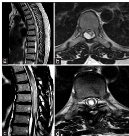
Figure 1: (a) Sagittal T2 dorsal magnetic resonance imaging (MRI) sequences showing multiple arachnoid cyst causing an important compression on spinal cord. (b) Axial T2 dorsal MRI sequences showing a cyst that compresses the spinal cord. (c) A sagittal T2 dorsal MRI showing cyst removal and intramedullary dilatation. (d) Axial T2 dorsal MRI showing intramedullary central canal dilatation