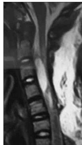
Figure 2: T2 magnetic resonance imaging sagittal