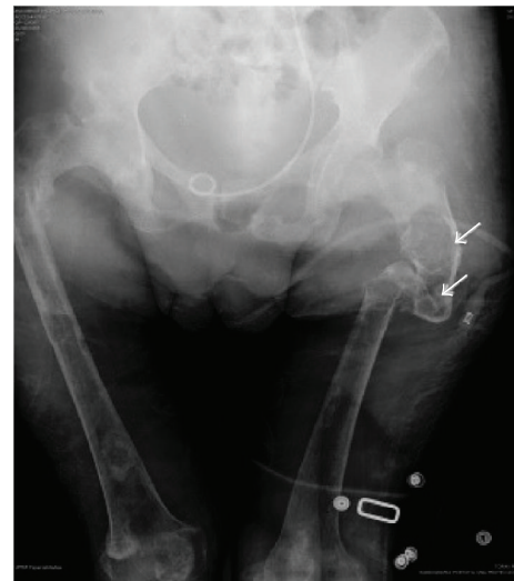
FIGURE 2: Pelvis X-ray with diffuse demineralization, marked decrease in cortical long bone, cysts, and brown tumors (arrows) and multiple pathological fractures for severe osteitis fibrous cystic.