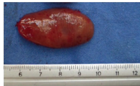
FIGURE 3: Ectopic parathyroid adenoma with approximately 4 cm dimension in the larger diameter.