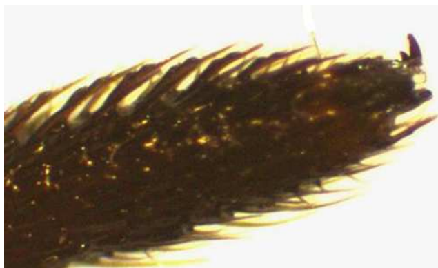
Fig. 4. Presence of one row comb-like hair under the fourth tarsus of Latrodectus hasselti