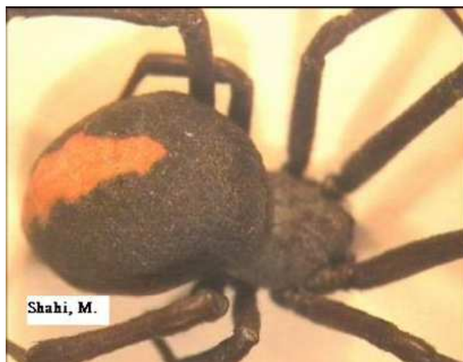
Fig. 2. Red-back spider collected from Bandar Abbas City, Iran, 2007