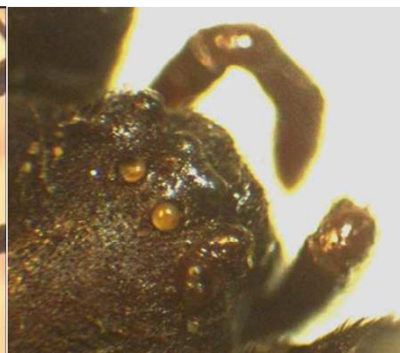
Fig. 3. Red-back spider's eyes pattern status