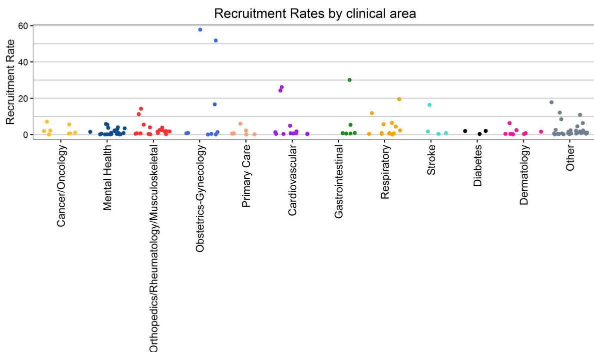
Figure 2 Recruitment Rates by clinical area for the 151 Health Technology Assessment trials considered.