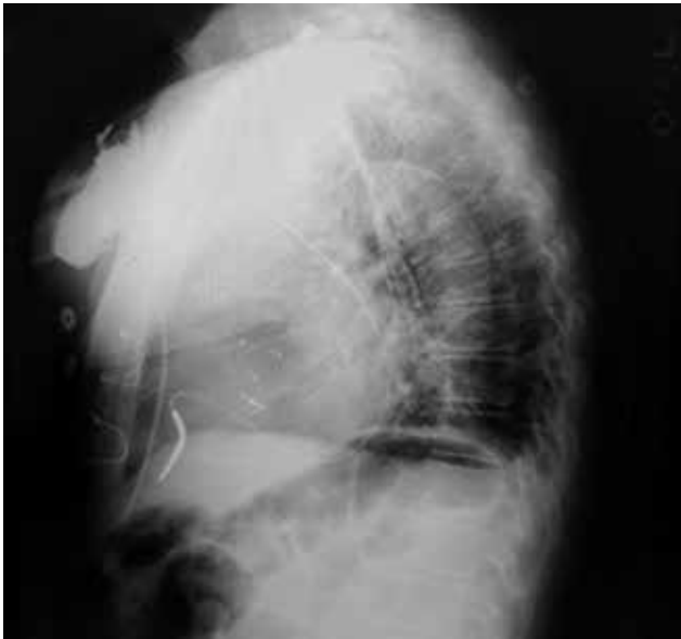
Figure 2: Chest radiograph demonstrating the final His-bundle and ICD lead positions.

nonsustained ventricular tachycardia were recorded during follow-up.